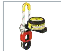
Hydrostatic Release Unit (HRU) Code: S05101