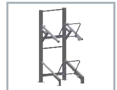
Column Racks Code: S04130